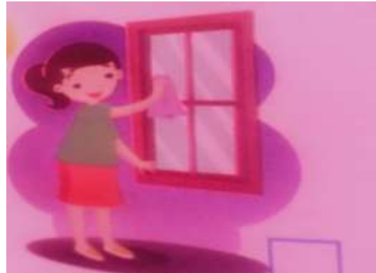
Figure 4. Women Cleans the Window

From Those pictures above we can see that women are commonly connected to domestic works (sweep the floor, mop the floor, cleaning the window glass, clean a lamp, preparing a meal/ a food seller). The women's occupations like a waiter, a food seller, and a cashier are also described as the minor, weak, warm, etc. At any rate, men are described as strong, leader, and aggressive contrasly with the woman, men are superior than woman. It can be seen on the picture below that the profession as teacher are appropriate for men. it describe that men are smart, leader and superior than women. that fact also shown in the picture figure 9. A scout leader describes that man tends to be powerfull and strong than women to be come the leader they commonly give commands and instruction as the leader. It shown that imbalanced gender include propession, roles, etc, still happens in this case.