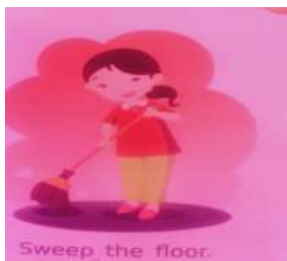
Figure 1. Women Sweeps

After analyzing data detail in every chapter in the coursebook, the writer found that some results. The first, we found that male pictures take a dominance in this coursebook by calculating female and male pictures in the coursebook we can know it. It can be said that the factors for woman/ and woman pictures take men dominantly in the coursebook than Woman. the writer also found that some stereotypes gender based on the pictures shown in the book that women tends to be minor in work than man. it can be seen in the following pictures below.