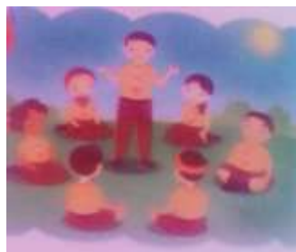
Figure 9. A Scout Leader