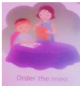
Figure 5. A Waiter

From Those pictures above we can see that women are commonly connected to domestic works (sweep the floor, mop the floor, cleaning the window glass, clean a lamp, preparing a meal/ a food seller). The women's occupations like a waiter, a food seller, and a cashier are also described as the minor, weak, warm, etc. At any rate, men are described as strong, leader, and aggressive contrasly with the woman, men are superior than woman. It can be seen on the picture below that the profession as teacher are appropriate for men. it describe that men are smart, leader and superior than women. that fact also shown in the picture figure 9. A scout leader describes that man tends to be powerfull and strong than women to be come the leader they commonly give commands and instruction as the leader. It shown that imbalanced gender include propession, roles, etc, still happens in this case.