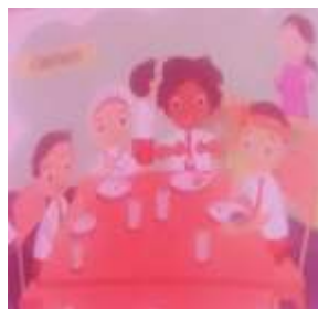
Figure 6. A Food Seller