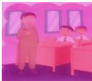
Figure 8. A Teacher