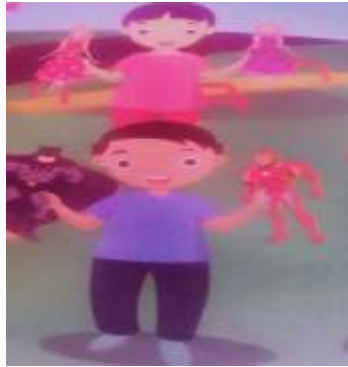
Figure 10. A Boy Plays Superhero Toys and A Girl Plays Barbie Dolls

This figure also shows such as a stereotypes that women plays barbie dolls and men plays the superhero like Batman and Ironmen. It obviously indicates that women as a cute, weak and feminine. while the man as the strong, aggressive and masculine.