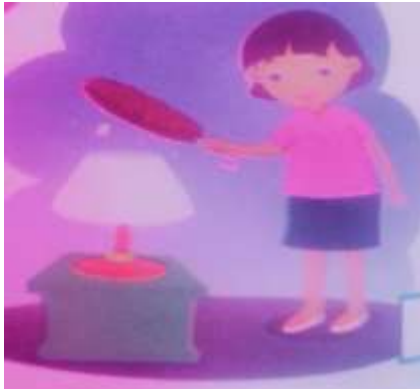
Figure 3. Women Dust a Lamp